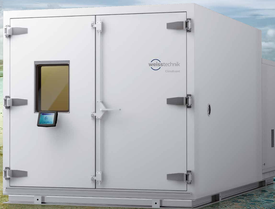
Illustration is similar, contains optional equipment