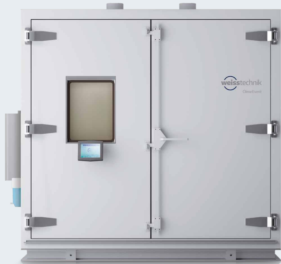
Illustration is similar, contains optional equipment

You can find further details on equipment in our technical descriptions. Contact us.