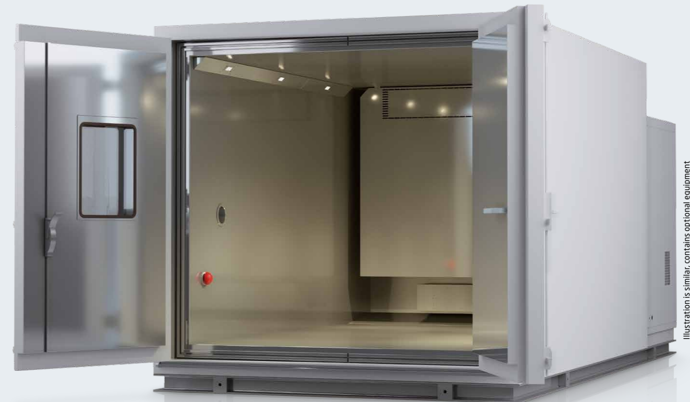
Illustration is similar, contains optional equipment

You can find further details on equipment in our technical descriptions. Contact us.